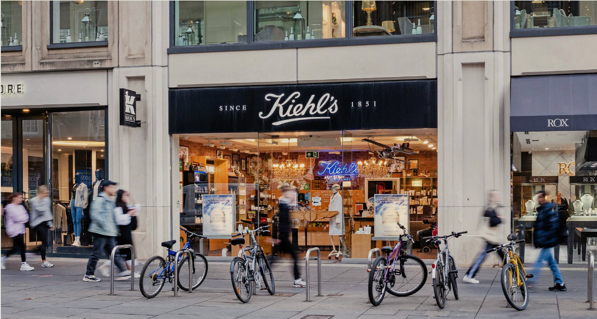
UNIT 9B MONUMENT MALL, NEWCASTLE CITY CENTRE