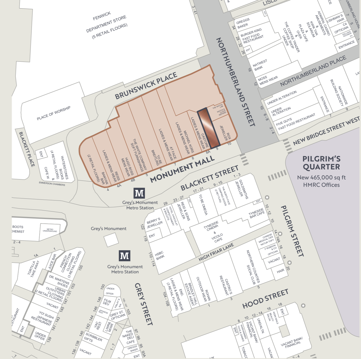
UNIT 9B MONUMENT MALL, NEWCASTLE CITY CENTRE

Bar and restaurant operators close by include Five Guys, TGI's, Chaophraya and Banyan.