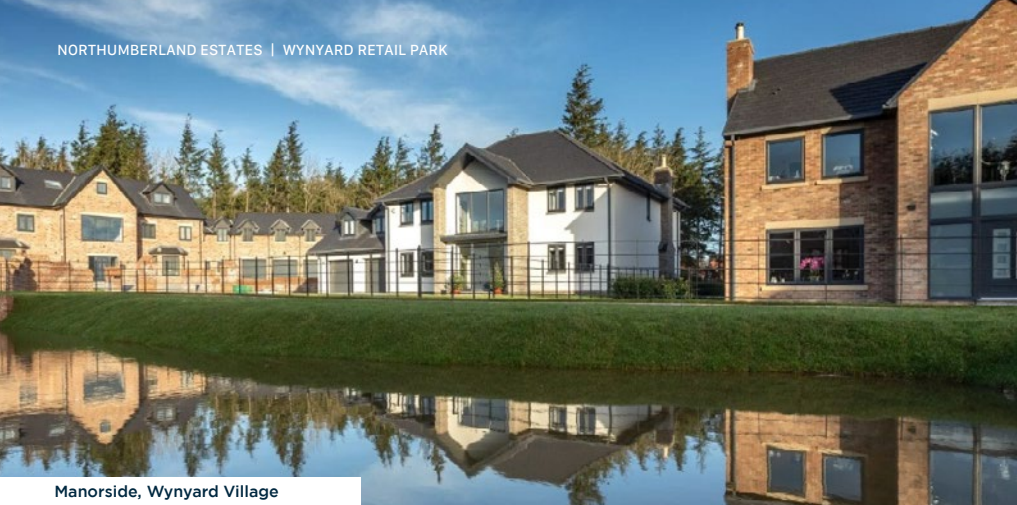
Manorside, Wynyard Village