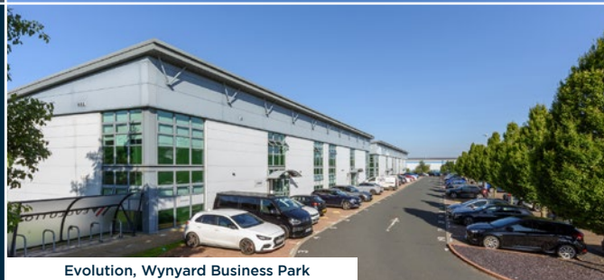
Evolution, Wynyard Business Park