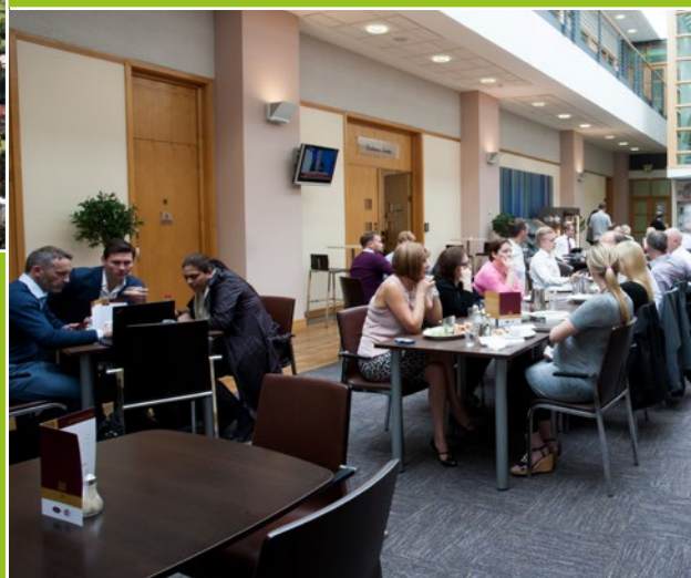
Wynyard Park House, Wynyard Business Park